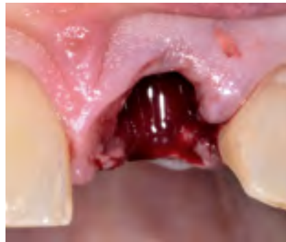
4 | Clinical view of the site immediately after "atraumatic" extraction. Note the vertical mattress suture placed to stabilize the distal papilla.