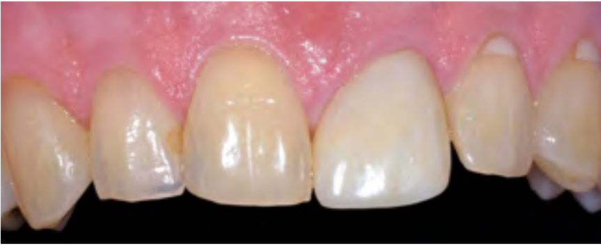
1 | Initial clinical view.