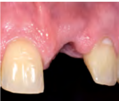
6a and b | Clinical views four weeks after extraction showing excellent healing. The socket is covered by a thin layer of newly-formed soft tissues.