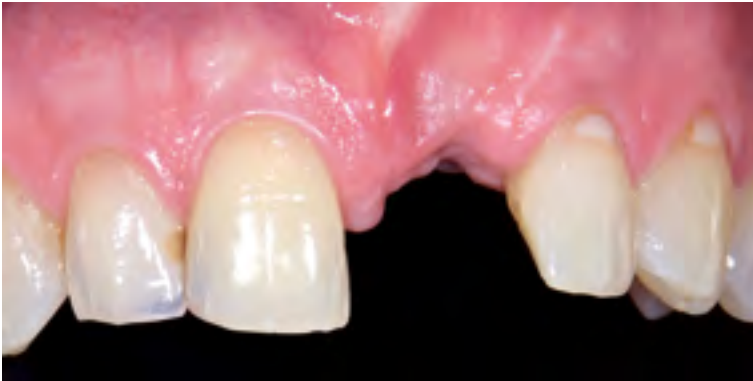
11 | Clinical view after ten weeks post-op.