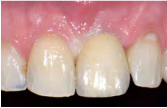
16 | Final crown fitted.