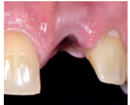
5 | Uneventful secondary intention healing one week post-extraction.