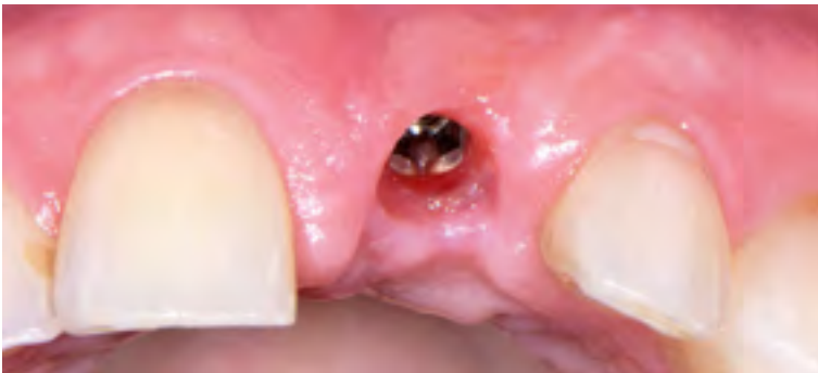
13 | Maturation of the soft tissues two weeks after placement of the healing abutment.