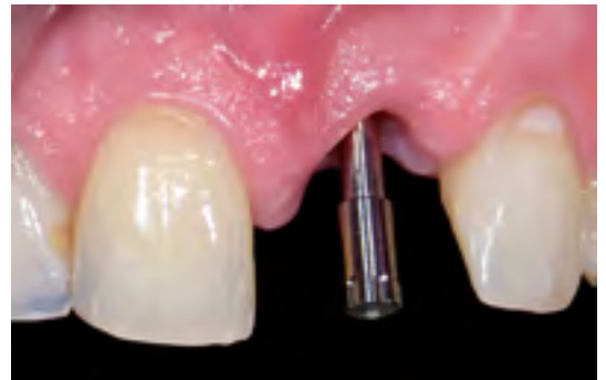
14 | ISQ measurement with Penguin.