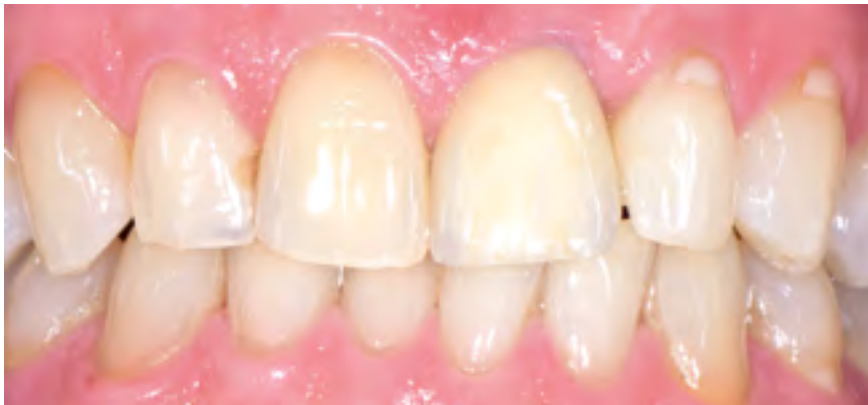
18 | Clinical view at two weeks follow-up.