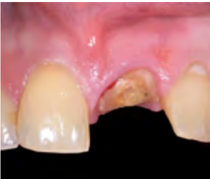
3 | Clinical view of the fractured root after removing the crown.