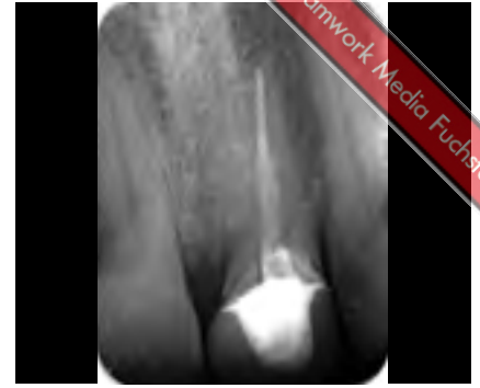
2 | Initial x-ray revealing the vertical root fracture.