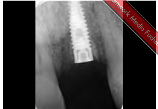
12 | Periapical x-ray view after ten weeks post-op.