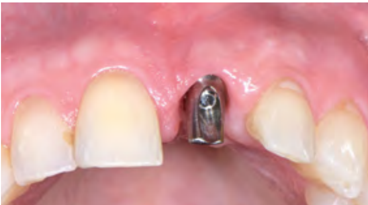
15a and b | Final abutment placed. Note the preservation of the architecture of the site.